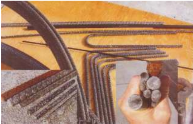
Fig.4 BCR bars compared with steel bars after exposure to environment