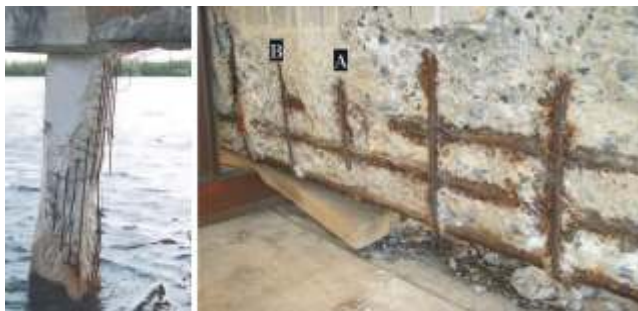
Fig. 2 Heavily corroded reinforcements in a typical marine structure, (b) Chloride-induced corrosion damage to a beam of the Brush Creek Bridge, USA

There are a wide variety of corrosion controlling technologies available in the world today each with its own special advantages, and economics. They include the following: