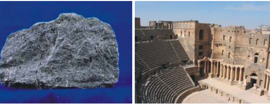
Fig.3 Typical basalt stone and the Roman theatre in Bosra, Syria; the dark building stone is basalt.

appearance. The name "basalt" is usually given to a wide variety of dark-brown to black volcanic rocks, which form when molten lava from deep in the earth's crust rises up and solidifies. Basalt differs from granite in being a fine-grained extrusive rock and having a higher content of Iron and Magnesium. The ocean floor is almost completely made up of basalt. Most of the basalt found on Earth was produced in just three rock-forming environments: 1) oceanic divergent boundaries, 2) oceanic hotspots, and 3) mantle plumes and hotspots beneath continents ( www.geology.com ). Basalt rock has long been known for its thermal properties, strength and durability. The density of basalt rock is between 2.8 and 2.9 g/cm 3 . It is also extremely hard - 5 to 9 on Moh's scale. It is commonly crushed for use as an aggregate in construction projects. Crushed basalt is also used for road base, concrete aggregate, asphalt pavement aggregate, railroad ballast, filter stone in drain fields and may other purposes. Due to its superior abrasion resistance, thin slabs of basalt are cut and sometimes polished for use as floor tiles, building veneer, monuments and other stone objects (see Fig.3).